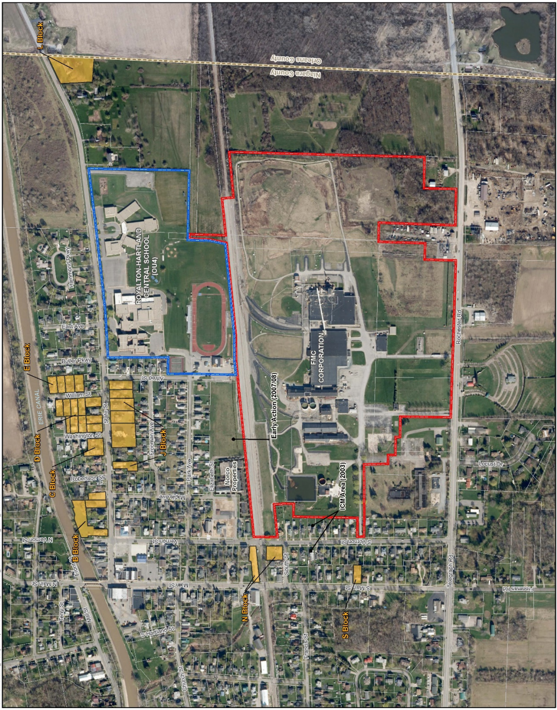
Figure 1 FMC Corp. Site, Operable Unit 2 Middleport, New York Updated: 3/3/2020 Legend County Boundary Tax Parcel Royalton-Hartland Central School FMC Site Location Remedial Status: Areas Containing Properties Anticipated to be Remediated in 2020