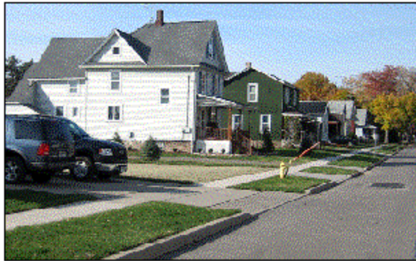
Park Avenue Block

FMC Corporation, with oversight by the government regulatory Agencies, has completed remedial work on 10 residential properties (9 on the south side of Park and 1 on Maple Avenue), the vacant wooded lot north of the FMC plant, and on portions of Culvert 105 (including Margaret Droman Park, and between Sleeper and Mechanic Streets).