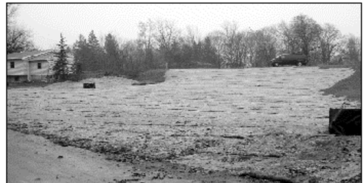
Culvert 105 (Margaret Droman Park)