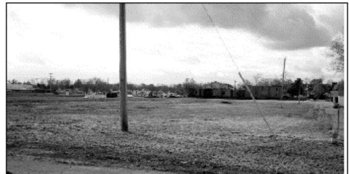
Coe Property (Culvert 105)

We will keep the community informed about