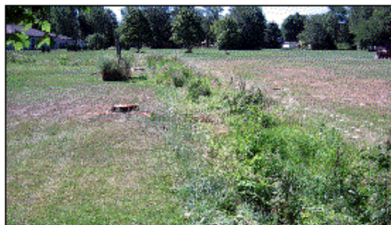
Culvert 105 (Sleeper/Mechanic Sts.)