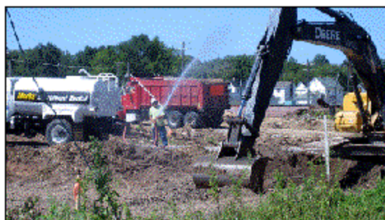
Wooded Lot (Coe Property)

FMC Corporation, with oversight by the government regulatory Agencies, began remedial work on the vacant wooded lot north of the FMC plant (Coe property), portions of Culvert 105 (between the canal and Sleeper Street, including Margaret Droman Park, and between Sleeper and Mechanic Streets) and on FMC's railroad property on the northern border of the plant site. Preliminary work before the removal of primarily surface soils on the residential homes (9 on the south side of Park and 1 on Maple Avenue) also began in mid-September with the clearing of vegetation.