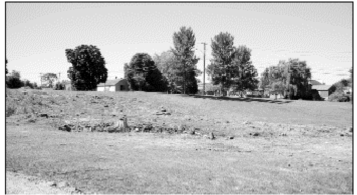
Culvert 105 (Margaret Droman Park)

All work is being conducted with oversight by the government regulatory Agencies and follows an approved health and safety plan. Particular attention has been given to controlling dust and minimizing inconveniences for residents.