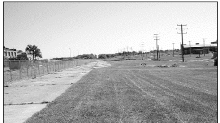
FMC-owned North Railroad Property