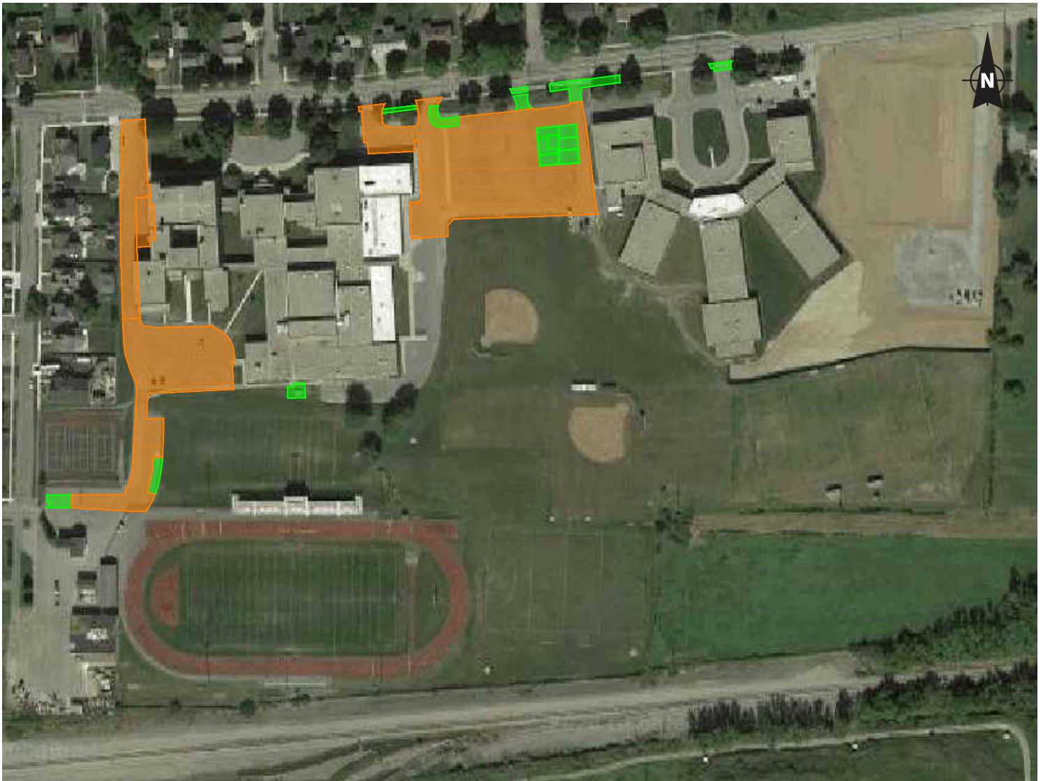
FIGURE 1 PHASE 6 WORK AREAS